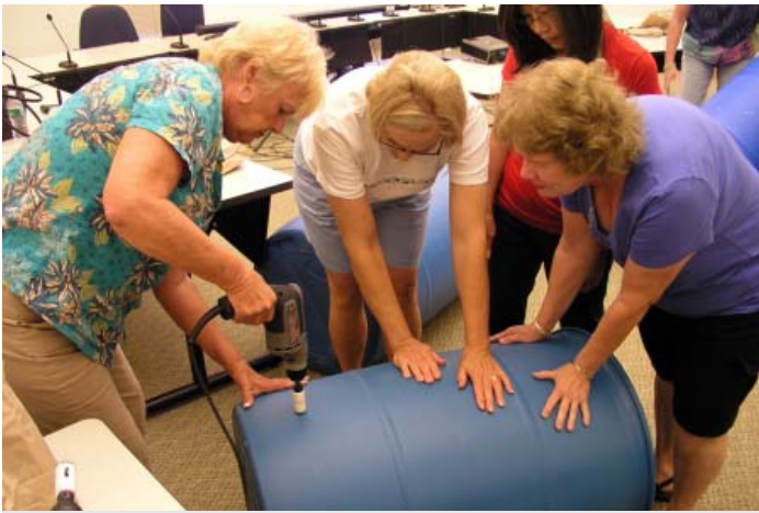
Participants learned how to make rain barrels during presentation sponsored by the Pinelands Commission in 2010.

it to support uniquely adapted Pinelands plants and animals. The students' findings were posted on the World Water Monitoring Day Web site ( www.worldwatermonitoringday.org ), where test results can be compared over time. In addition to assisting with the water tests, staff from the Pinelands Commission used nets to catch native Pinelands fish and demonstrated how the Commission protects wetlands and habitat for rare plants and animals.