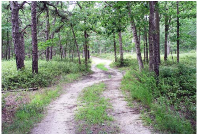
The property above is among the forested areas that will be permanently preserved under the Richard Stockton College's new Master Plan, which the Pinelands Commission approved in 2010.

In September 2010, the Commission approved a new master plan for the Richard Stockton College of New Jersey in Galloway Township, Atlantic County. The Plan sets forth a comprehensive blueprint for the future development and expansion of the College's campus in recognition of increased enrollment and projections of future growth. The Plan permanently protects 1,257 acres of land on and near the college's campus, including 170 previously developable acres. It also increases the size of the College's development area by approximately 450 acres and the amount of developable land by 151 acres. The College also agreed to use low-impact design and construction principles by minimizing disturbance of forested areas, clustering development away from wetlands and deed restricted areas, and minimizing turf.