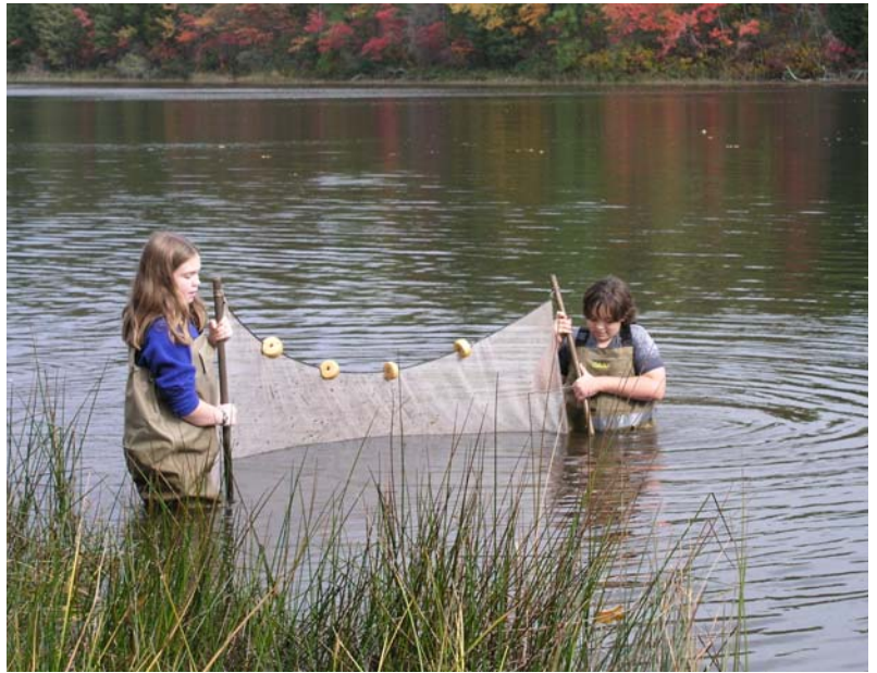
More than 180 students and teachers participated in the Commission's annual World Water Monitoring Day Event. Students above use a net to survey for native Pinelands fish.