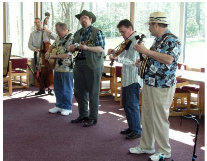
The Bad Dogz were among the live bands who provided musical entertainment during the 21st annual Pinelands Short Course.

The Pinelands Short Course is sponsored by the Commission, the Pinelands Institute for Environmental Studies (or P.I.N.E.S.) and Burlington County College, which has hosted the event at its Pemberton Township campus since 2004. The event is registered with the New Jersey Department of Education, and professional development credits are available to New Jersey teachers who attend.