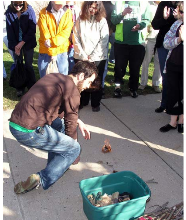
Participants learned how to make fire during a Pinelands Survival course offered during the 21st annual Pinelands Short Course. The event drew a record crowd of more than 800 people.